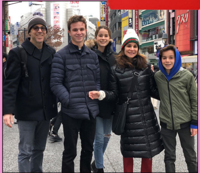
Left: Before the Westlake ninth grade dance, 1986 | Right: The Nickoll family in Tokyo, 2019