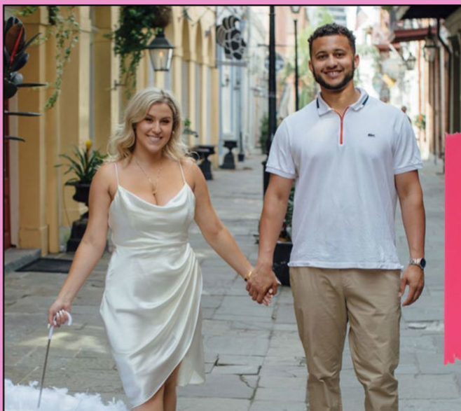
Left: In HW colors before their ninth grade homecoming dance, 2014 | Right: In New Orleans celebrating their graduation from Tulane University, 2021