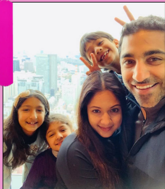
Left: At ring ceremony, 1998 | Right: The Gandhi family in Tokyo, 2019