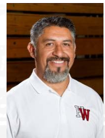
CARLOS SAMAYOA ATHLETICS FACILITIES