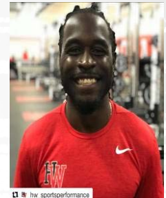
JUNIOR AMAZAN SPORTS PERFORMANCE