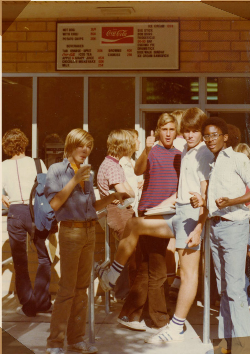
Harvard School snack bar (selling 75-cent hot dogs and 30-cent sodas), 1970s