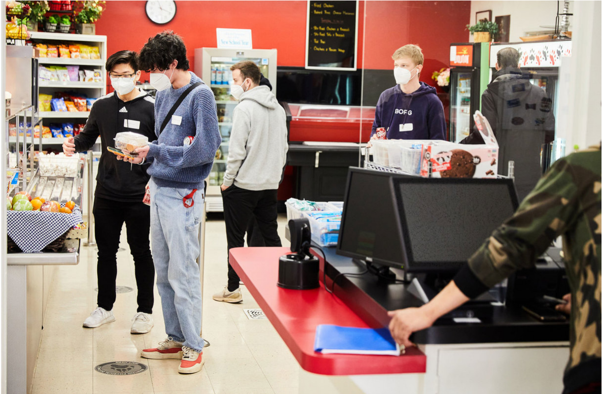
The upper school cafeteria, 2021

Leslie Forbes Owens '74: Guess I'm too old! No cafeteria, nor lunch card! Westlake '74 and proud!