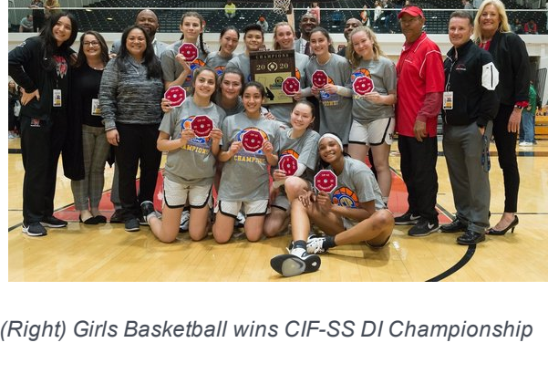
(Left) Girls Water Polo wins CIF-SS DII Championship (Right) Girls Basketball wins CIF-SS DI Championship