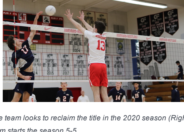
(Left) Softball. Defending Sunshine league champions, the team looks to reclaim the title in the 2020 season (Right) Boys Volleyball. The team starts the season 5-5.

Visit www.hw.com/athletics or download the HW Athletics App to view specific team score reports, rosters, and more. Go Wolverines!