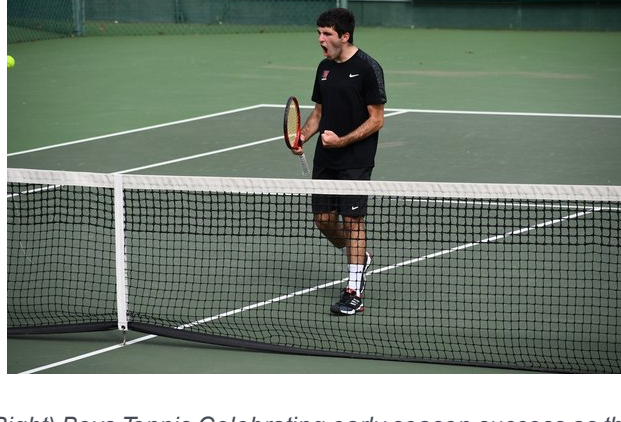
(Left) Girls Soccer: 2020 Mission League Champions (Right) Boys Tennis Celebrating early season success as the team looks to continue their undefeated streak.